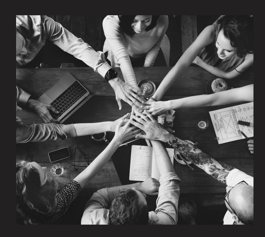
JOIN US & WĀNANGA